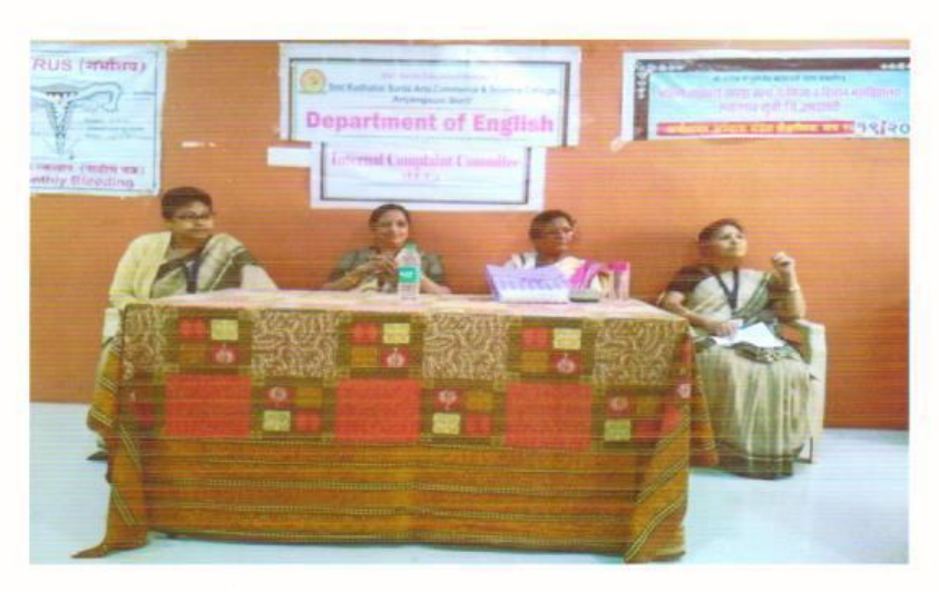
6th Jan 2020